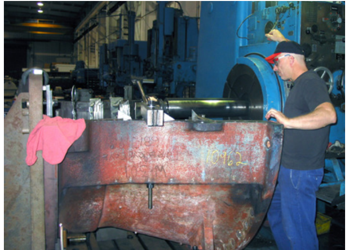
Casing restoration for turbines and compressors.