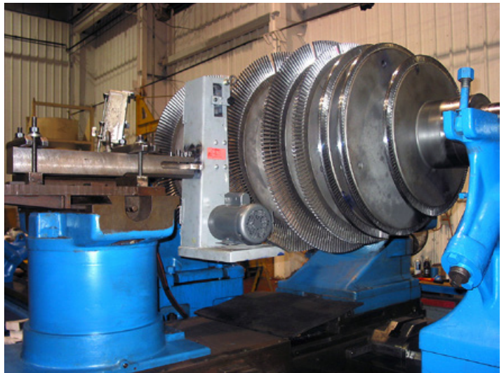
Tip grinding of blades.