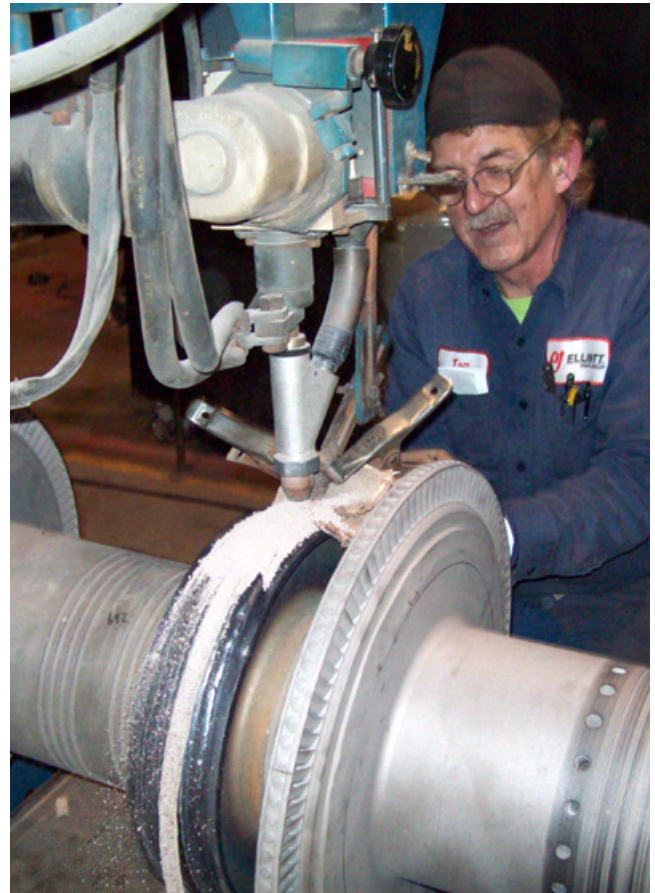
Submerged arc welding repair of a steam turbine disk.

With more than a century of turbomachinery experience and a tradition of excellence, Elliott can provide you with a single, comprehensive source for all your rotating equipment needs. We know what it takes to keep your equipment performance high and your maintenance cost low.